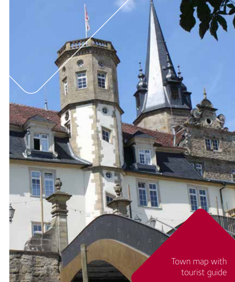
Town map with tourist guide